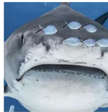
Tiger Beach, Grand Bahama, julho de 2014