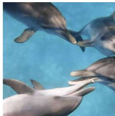
Golfinhos-pintados jovens brincando, Bimini, Bahamas, julho de 2014

Fish purchase policy - fish in season and respecting the size. Exclude fish from the "red list"