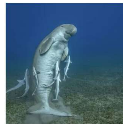
Marsa Mubarak, Egito, dezembro de 2017